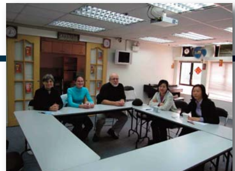
Some of the workers in Hong Kong